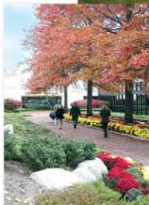
Corporate headquarters, Weichert, Realtors, Morris Plains, NJ